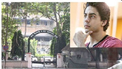
Aryan Khan can now travel outside India with the NDPS Court allowing the return of his Passport.

While allowing the return of Aryan's passport, the judge took note of the fact that Aryan was given a clean chit by the Narcotics Control Bureau (NCB) in the charge sheet.